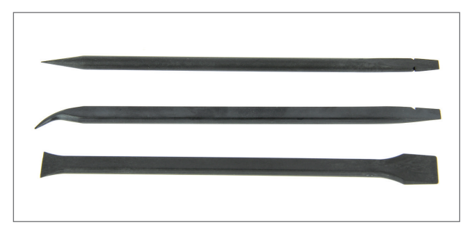
MPT123 Kit of MPT1R, MPT2, MPT3

Squared body - Curved fine tip and flat strong tip Lenght: 150 mm, 5.90"