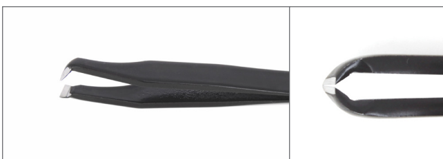
15ARW.C.N ESD Epoxy full body coated Cutting Tweezers