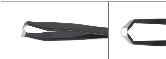
15AGW.C.N ESD Epoxy full body coated Cutting Tweezers