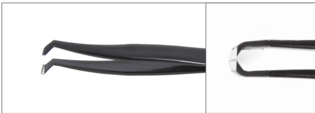
14AGW.C.N ESD Epoxy full body coated Cutting Tweezers

Use Ideal-tek Cutting Tweezers for cutting soft wires such as copper, gold, silver as well as magnetic wires and hard hairsprings