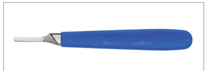
6A SM Handle only (acrylic handle) - Made in Great Britain