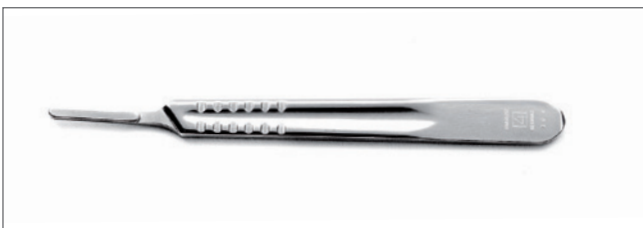
4 Handle only - Made in Germany

Handles no. 4 and 6A SM fit large fitment blades (420 SM, 421 SM, 422 SM, 423 SM, 424 SM, 425 SM, 425A SM, 426 SM, 436ST SM).