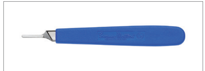
5A SM Handle only (acrylic handle) - Made in Great Britain