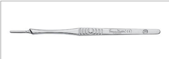
7 SM Handle only - Made in Great Britain