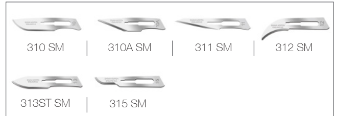
Small fitment blades For handles 3, 5A SM, 7 SM - Made in Great Britain

Handles no. 4 and 6A SM fit large fitment blades (420 SM, 421 SM, 422 SM, 423 SM, 424 SM, 425 SM, 425A SM, 426 SM, 436ST SM).