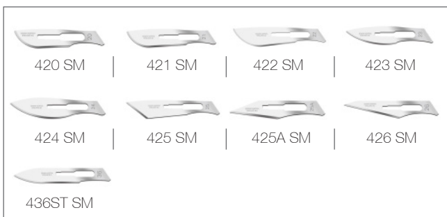
Larger fitment blades For handles 4, 6A SM - Made in Great Britain