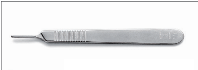
3 Handle only - Made in Germany

Handles no. 3 , 5A SM and 7 SM fit small fitment blades (310 SM, 310A SM, 311 SM, 312 SM, 313 SM, 315 SM).