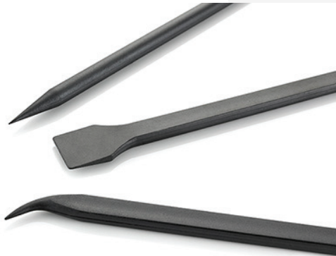
PROBES & SPATULAS