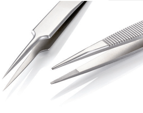
TWEEZERS & FORCEPS