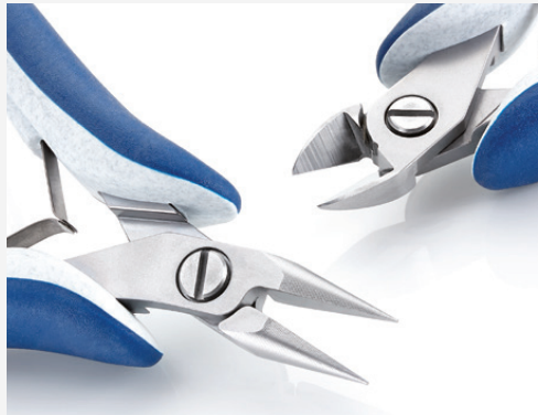
CUTTERS AND PLIERS