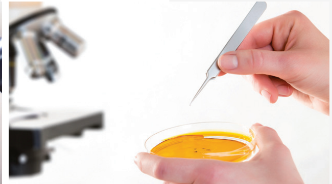
MICROSCOPY & LABORATORY