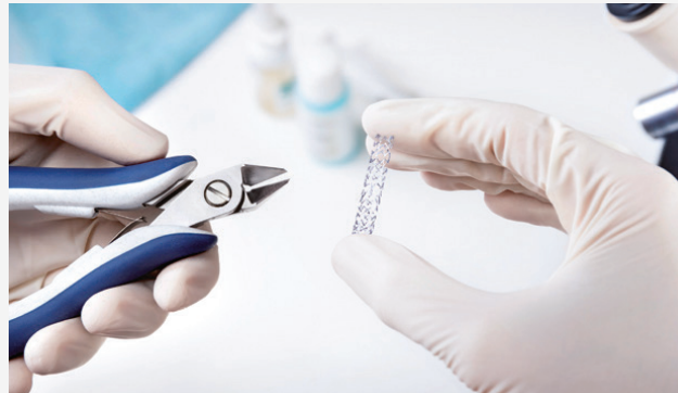
MEDICAL DEVICE MANUFACTURING