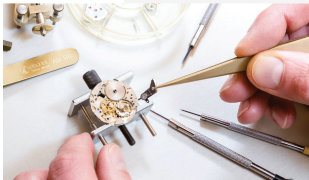
WATCHMAKING & JEWELLERY